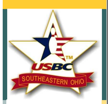
Come join the fun!