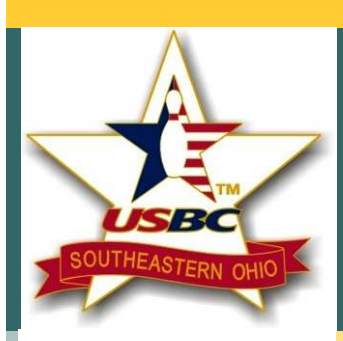
Come join the fun!